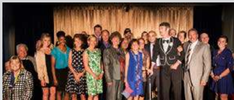
Honorees at the banquet

Famed mountain runner and 1988 Olympic cross-country