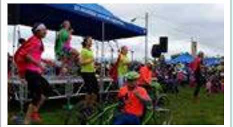
Anchorage RunFest – Healthy Heroes led by Kikkan Randall got kids excited before the Anchorage RunFest 2K at Delaney Park Strip.