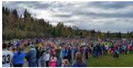
Jamboree South Anchorage – Healthy Futures again partnered with the Anchorage School District for the elementary school Running Jamborees attended by more than 3,000 kids combined at events in South Anchorage, North Anchorage and Chugiak.