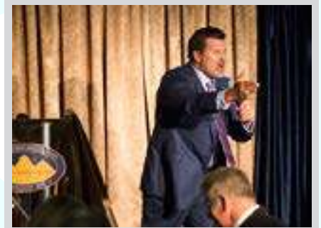
Mark Schlereth gives Keynote at banquet