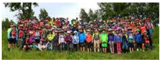
Mighty Bikes – The Mighty Bikes program attracted 300 youth who improved their mountain biking skills.