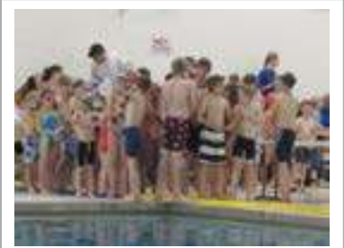
Eagle River Triathlon – The Eagle River Kids Triathlon gets kids swimming, biking and running.